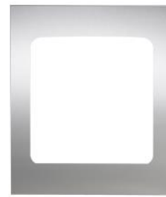
Filler Panel 3096040