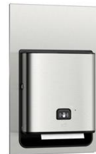
Image Design Matic with Intuition Sensor Recessed Dispenser: 461122