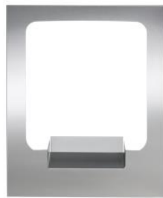
Filler Panel 3096020